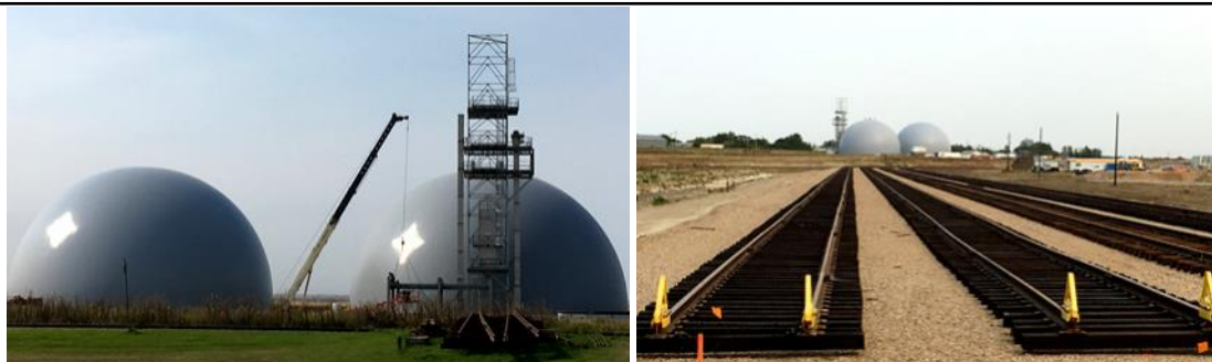
Recent pictures of the development west of the tracks.

Section 7(1) “Subject to subsections (2) and (3), the owner of each building in Saskatchewan shall ensure that the building is designed, constructed, erected, placed, altered, repaired, renovated, demolished, relocated, removed, used or occupied in accordance with the building standards.”